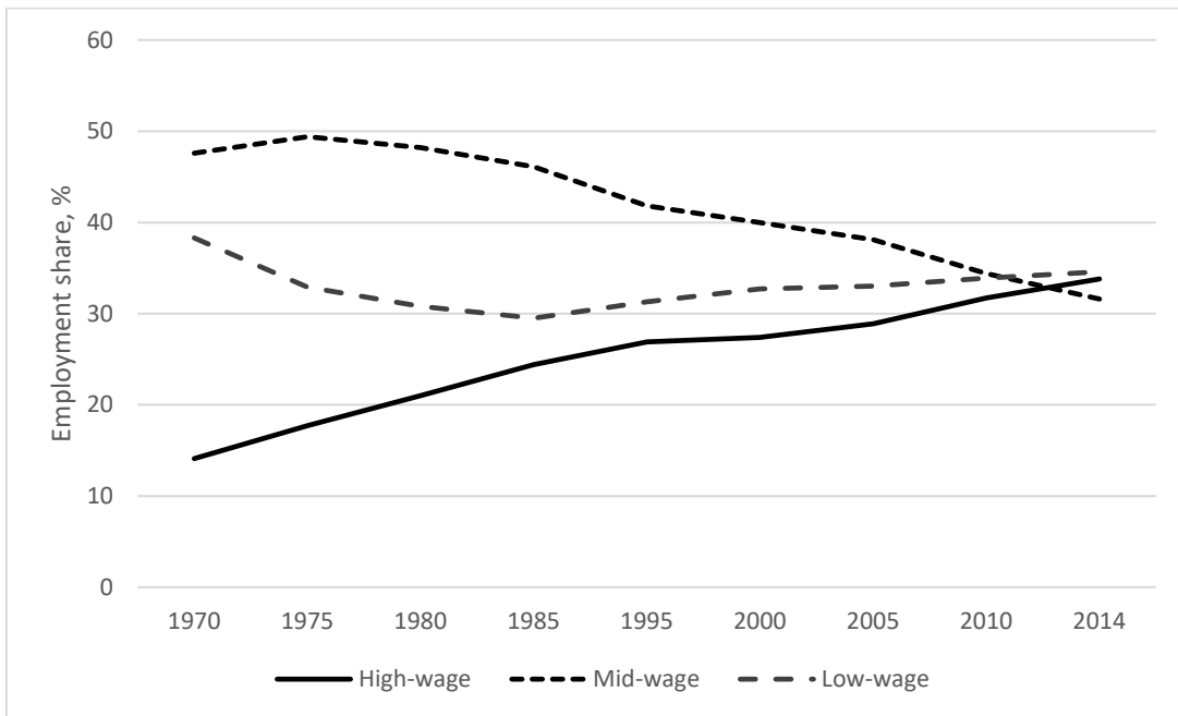
Figure A1: Job polarization in Finland, 1970-2014: the share of high-wage, mid-wage and low-wage worker groups